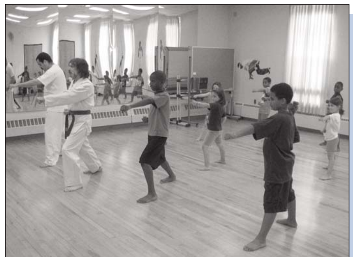
MARTIAL ARTS. Year-round classes in Tae Kwon Do at the La Mott Community Center incorporate discipline and physical conditioning as well as martial arts techniques for students ages 6 and over at all skill levels.

Learn the basic techniques of Korean karate, emphasizing physical conditioning, self-defense and discipline.