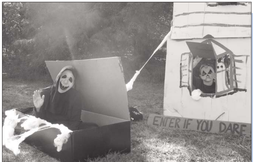
HARVEST THRILLS. The Community Harvest Festival hayride includes a contest for the best spooky or friendly scenes created and run by local families or organizations. For details on how to compete in this year's event on October 15, call 215-887-6200, ext. 760.

Friday, Dec. 2 • 5:00 p.m. – 8:00 p.m. • Wesley Plaza, off Easton Road, Glenside During WinterFest, Santa will visit the decorated Wesley Plaza on a shiny, red fire truck to deliver free candy canes. Hot chocolate and cookies will be provided by local businesses, while area students sing seasonal carols. Information: 215-576-5583.