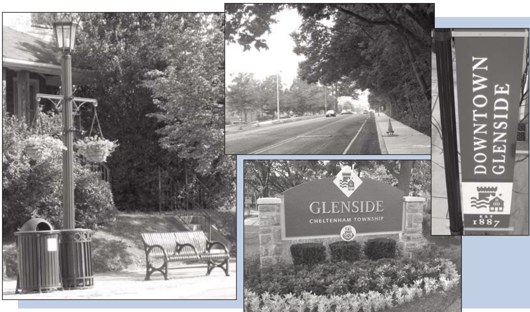
EASTON ROAD ENHANCEMENTS. Streetscape improvements on Easton Road between Springhouse Lane and Limekiln Pike (top, center) should be finished this fall. Earlier enhancements include decorative streetlights, hanging flower baskets, benches, and refuse and recycling containers (left), Downtown Glenside identification banners (right) and a gateway monument sign at Limekiln Pike and Easton Road.