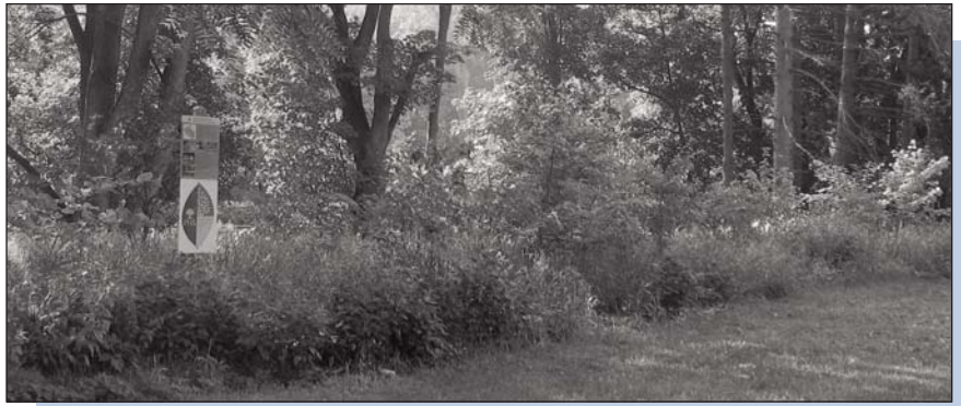
RIPARIAN BUFFER. A thriving riparian buffer of native plants, purchased through a Tree Vitalize Grant, helps filter out pollutants before they reach the Tookany Creek in the park along Cheltenham Hills Drive. Residents who live adjacent to waterways are also encouraged to establish a 10-foot “no mow” buffer to reduce pollution and improve the health of local waterways.

To offer recommendations or check for updates on the sustainability effort, visit www.cheltenhamtownship.org . □